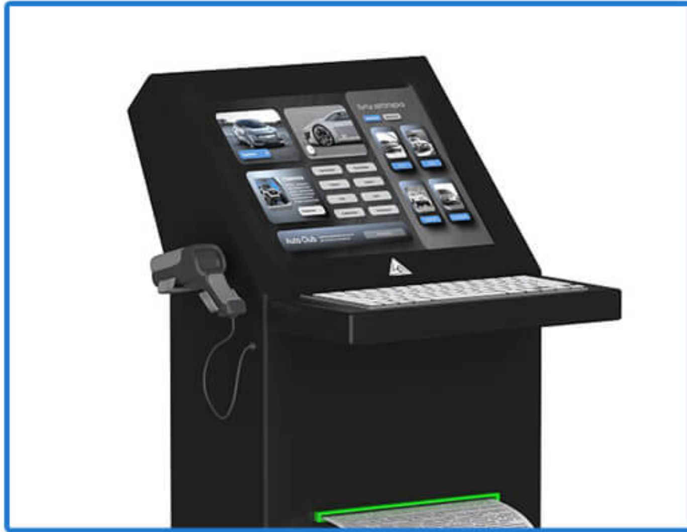
embedded in KIOSK