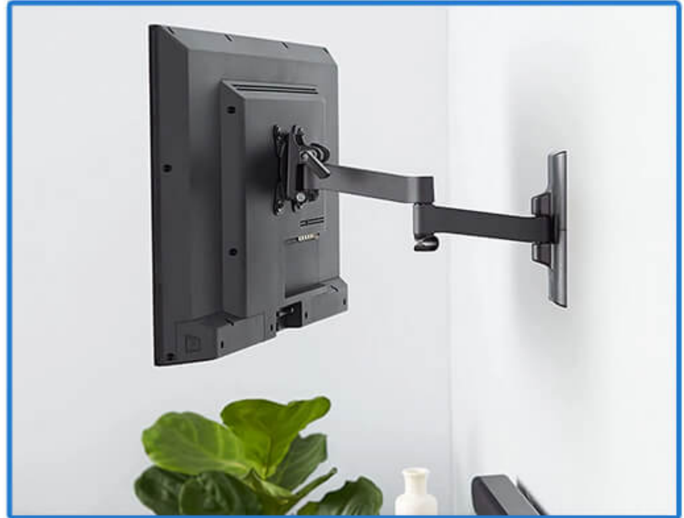
Vesa Hang bracket (75x75mm)